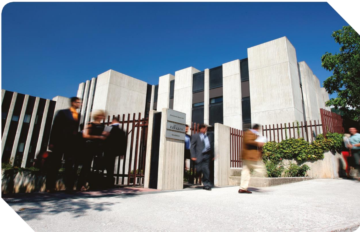
Figure 1 – Headquarters of Colacem S.p.A. - Gubbio (PG)