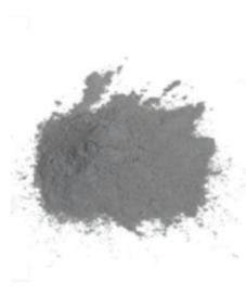
Figure 2 - Bulk cement